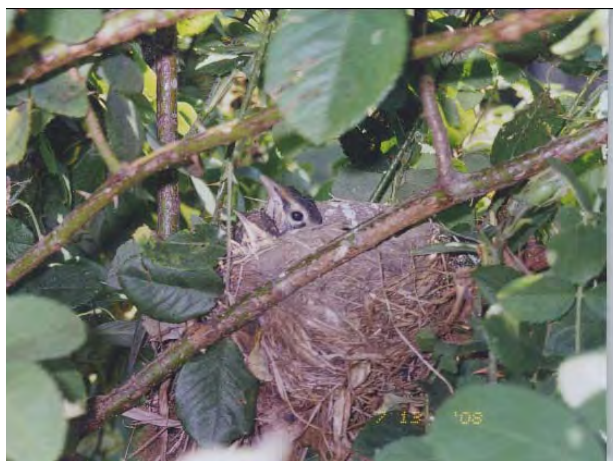
Autumn Damask (and with robin)