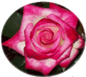
Desperado hybrid tea

But I want to encourage everyone to bring roses to the show. Don't be afraid to go out in the yard and cut roses on Saturday or Sunday morning and bring them to enter. It only takes one beautiful rose to garner Queen of Show, or a little beauty to float in a bowl or put in a frame. Every rose is welcome, as is each exhibitor. Someone in that prep room will be able to help you if you have a question about where or how you should put your rose into the show. You can't learn if you don't ask!